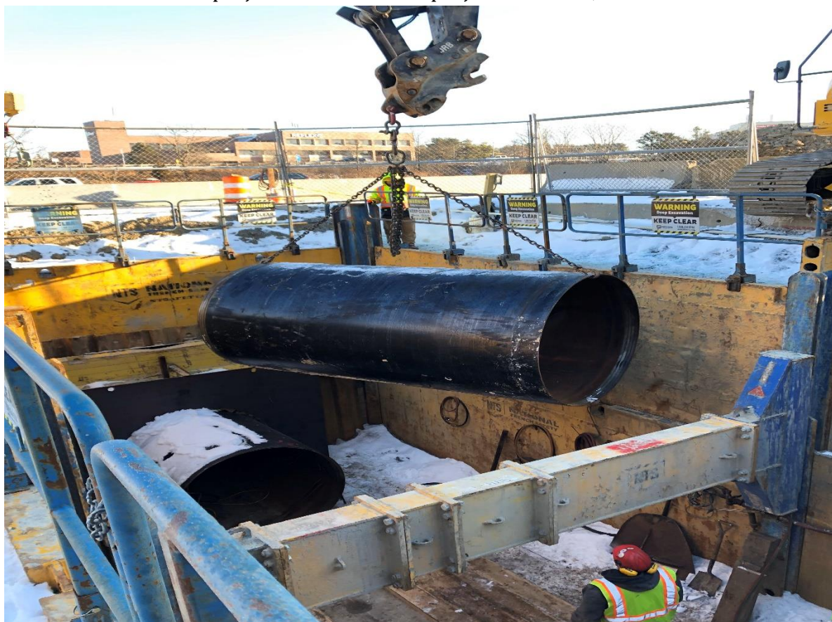
Section of pipe lowered into the pipe jacking pit to be installed beneath the highway near the East Street Rotary

In 2020, the DWWD installed a new pipeline underneath Route 128 at the East St Rotary. The project was done in partnership with the MWRA as they were also installing a new pipe crossing the highway. This allowed the DWWD work to be done at a much lower cost than if done as a stand-alone project. The cost of the project was $626,000.