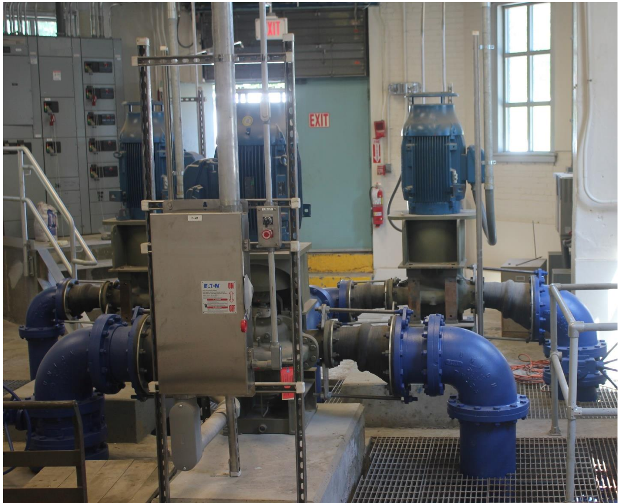
New Finished Water Pumps installed as part of the Modernization Project.

systems, treatment process and pumping equipment replacements, new emergency generator and a new building to house filtration equipment. Additional items added to the scope of work after construction began included new raw and finished water piping, a new roof on the Pre-Treatment Building and new water quality automatic analyzer equipment. The project received a 2% loan from the Massachusetts Clean Water Trust.