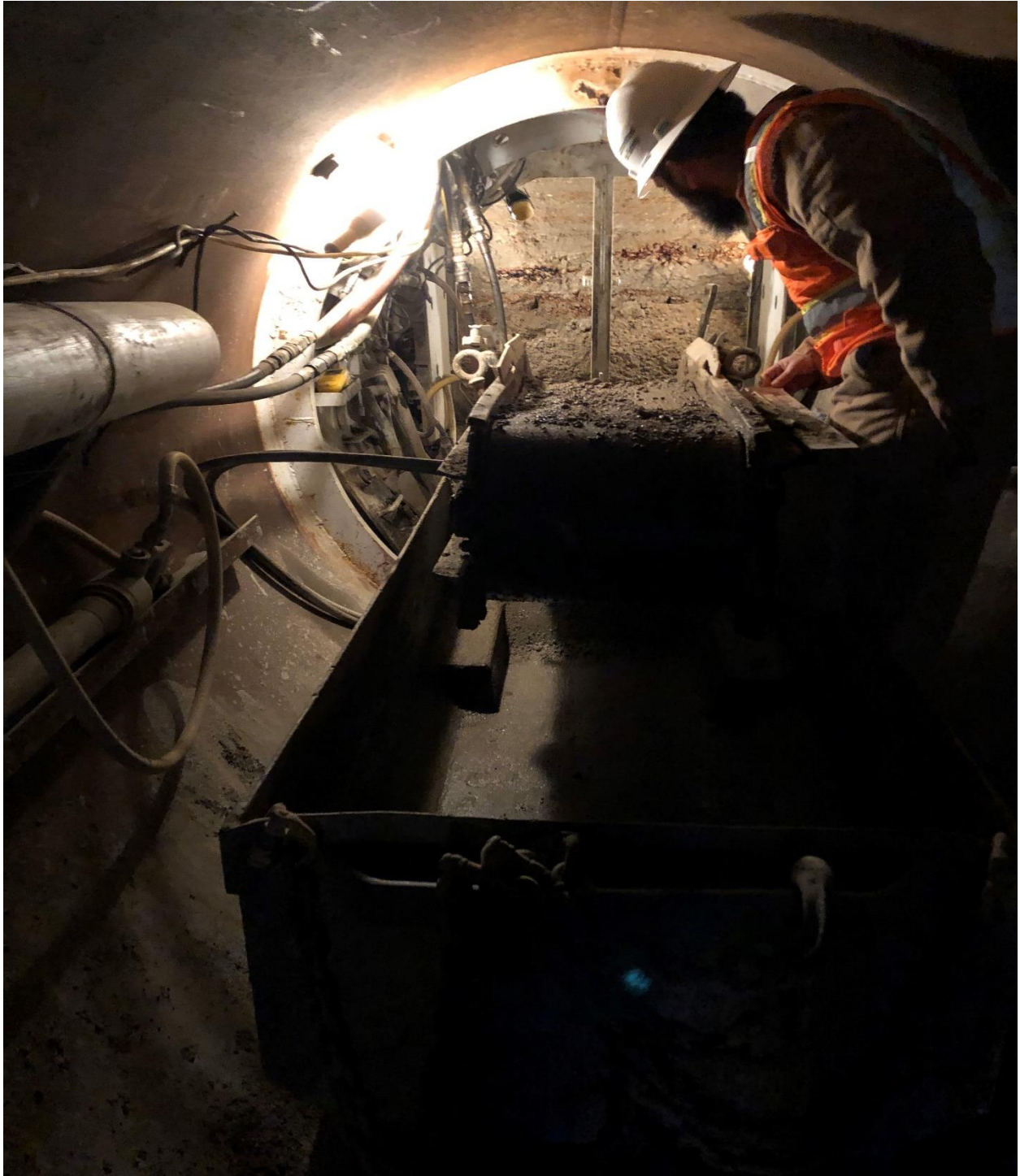
Worker at open face of jacking pit showing soil, conveyor ramp, and cart for hauling spoils out of tunnel.

The Bridge Street Water Treatment Plant went back online in May 2020. The Modernization project begun in 2017 took significantly longer than originally scheduled. The project exceeded the original budget of $8.8 million dollars by $772,000. The treatment plant has undergone renovation to the structure, the heating, cooling and ventilation